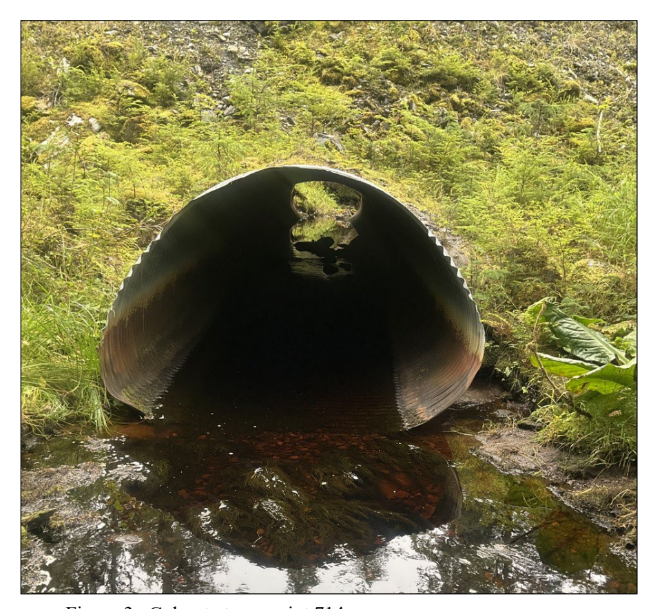
Figure 3.–Culvert at waypoint 714.