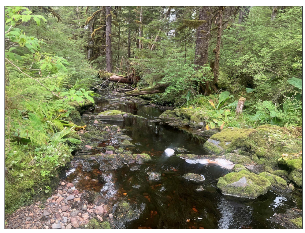
Figure 2.—Channel at waypoint 714.