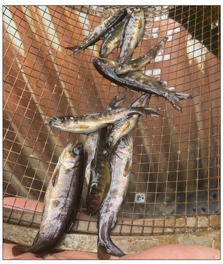
Figure 1.—Juvenile coho salmon captured at waypoint 714.